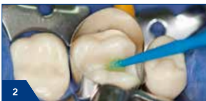
2 Coating of the cavity walls with Futurabond DC