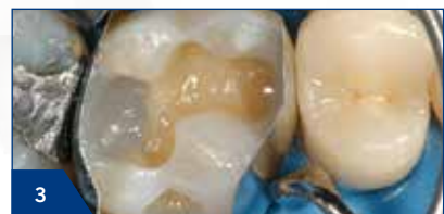
3 Start at the deepest point in the cavity ...