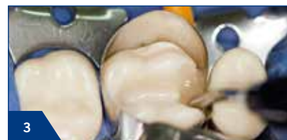
3 Start at the deepest point in the cavity...