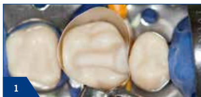
1 A fully prepared cavity

The flowable consistency makes it easy for the material to flow into the smallest undercuts. The smart self-leveling effect saves time. x-tra base will level by itself without slumping out