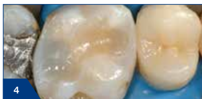
4 Filling the cavity in 4mm increments