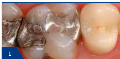
1 An amalgam restoration in need of replacement