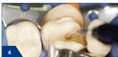
4 ... and fill up to 4mm with x-tra base