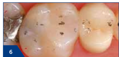
6 Finished restoration after occlusal verification