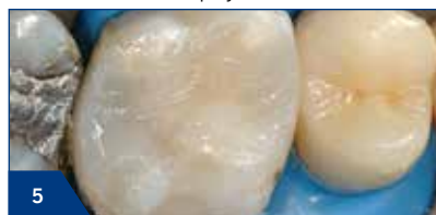
5 Filling the palatal cavity