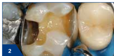
2 The glistening surface indicates excellent wetting with the bond before polymerization