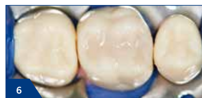
6 Finished restoration