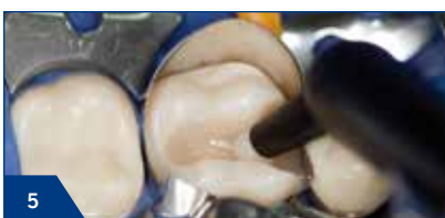
5 Apply a 2-mm occlusal layer of GrandioSO