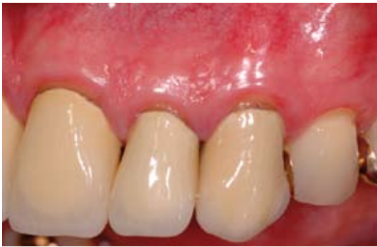
Initial situation on crowned teeth 9-11