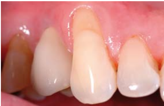
Initial situation on tooth 6