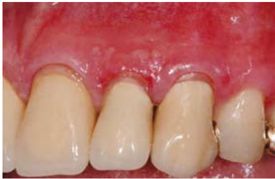
Cervical crown restorations with Amaris Gingiva