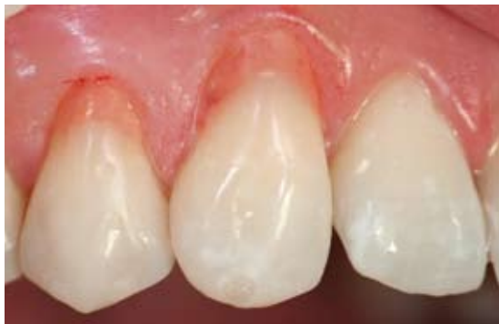
Cervical restorations with Amaris Gingiva