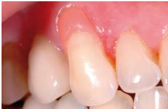
Amaris Gingiva restoration after 4 days