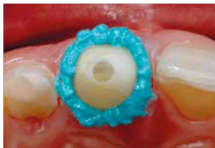
Applied VOCO Retraction Paste