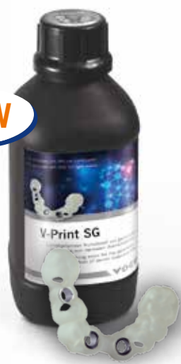
V-Print SG Bottle 1000 g clear