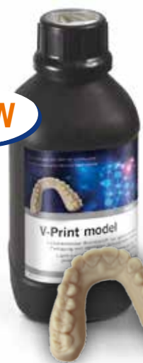
V-Print model Bottle 1000 g beige