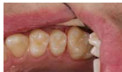
Figure 10: The final restoration.