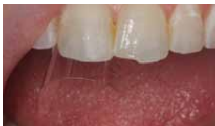
Figure 03: Futurabond U on the tooth after curing.

enamel for ten seconds (figure 2). After thoroughly rinsing off the etchant, a mylar strip was placed between tooth 11 and tooth 21, and Futurabond U was brushed on the enamel for twenty seconds and air dried for five seconds. Futurabond U was then light cured for ten seconds. One of the nice things about Futurabond U is that you can see it on the tooth after curing (figure 3). This reinforces the fact that you have adhesive in place before placing the direct restorative. The final restoration is placed (GrandioSO, shade A1, VOCO), light cured, finished and polished (figure 4).