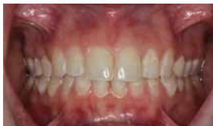
Figure 04: The final restoration is placed, light cured, finished and polished.

to bond restorations in any manner that you like. In other words they allow you to "Have it Your Way". ♦