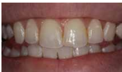
Figure 01: A chip on the incisal edge of tooth 21.