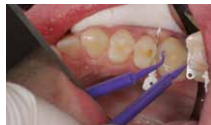
Figure 08: Futurabond U was used here in the self-etch mode.