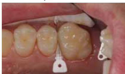
Figure 09: A highly filled esthetic flowable composite was used to fill the cavity.