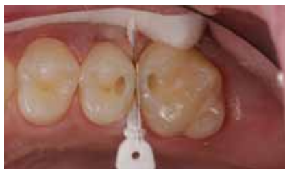
Figure 07: Tunnel preparation to access and remove the decay on both teeth.