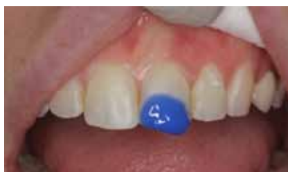
Figure 02: A 37% phosphoric acid was used on the enamel for ten seconds.

Universal adhesives such as Futurabond U are the newest advances in dentistry as it relates to the bonding process. They eliminate the need for multiple adhesive systems and allow you