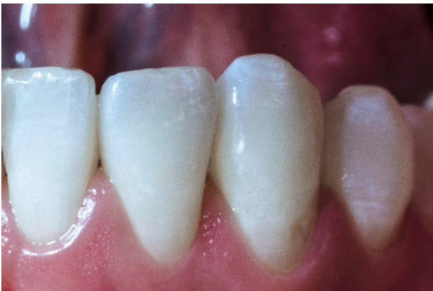
Fig. 3 & 4: Intact tooth surface and without defects after treatment.