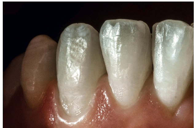
Fig. 4: Intact tooth surface at a closer look.