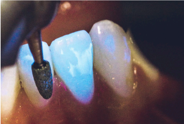
Fig. 1 & 2: Removal of composite residues with a tungsten carbide drill, using a UV light source (wavelength of 360-370 nm, intensity of at least 20 mW/cm 2 ) and a distance of 50 cm.