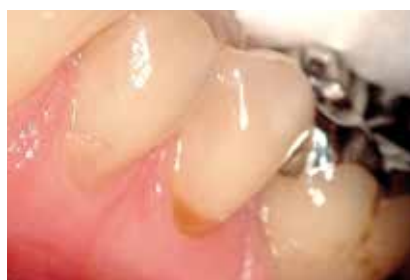
Tooth 35 with cervical defect