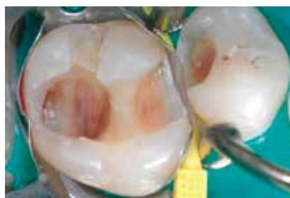
Teeth 16, 15 after excavation