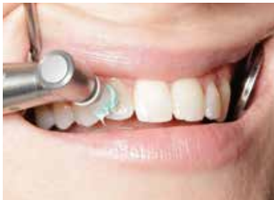
Fluoridation with Bifluorid 10 after a professional cleaning

Bifluorid 10 is the ideal preparation to effectively alleviate these complaints. Bifluorid 10 is ideally suited for accelerated remineralisation and fluoridation of tooth substance. Bifluorid 10 also prevents secondary caries after restoration, especially after employment of the etching technique.