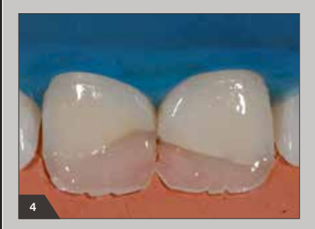
Application of Amaris TL to reconstruct the palatal enamel portion