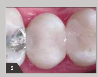
Finished, polished restoration

Peridontology, Conservative and Preventative Dentistry Clinic, Centre for Dental and Oral Medicine, Rheinische Friedrich-Wihelms University of Bonn, Welschnonnen St. 17, 53111 Bonn, Germany