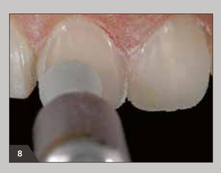
High gloss polish of the restoration