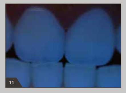
Fluorescence like with natural teeth