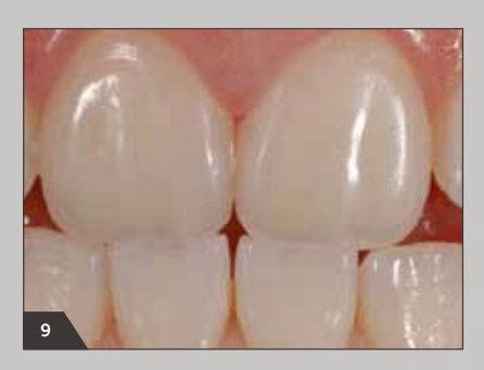
Completed anterior restoration