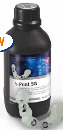
V-Print SG Bottle 1000 g clear REF 6043