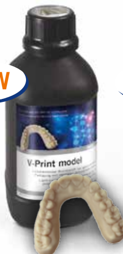
V-Print model Bottle 1000 g beige REF 6042